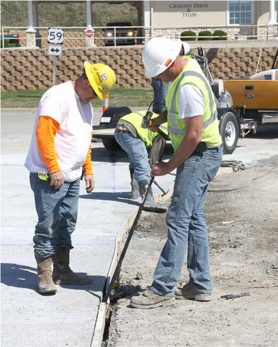
Sunshine, robins and highway construction workers are true signs of spring Traffic was stalled again at the intersection of Highway 118 and Highway 59 - In Mound City on Monday, March 28, as workers from Chester Bros Construction of Hannibal, MO, returned to remove the forms from the concrete work done days earlier. The much needed repairs will improve the approach from Highway 118 onto Highway 59.