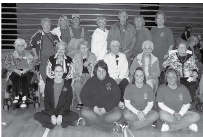
Several residents and staff of Tiffany Heights in Mound City- Enjoyed participating at the Golden Age Games in St. Joseph, MO, on Friday, April 13.