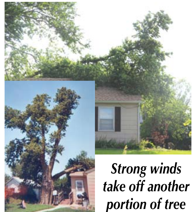
Strong winds take off another portion of tree

Stong winds- Early Saturday morning, June 18, pulled and twisted off part of this huge hackberry tree that is now located on the roof of Warren and Loretta Morris' home east of Mound City. At around 6:00 a.m., after a period of quiet and clear conditions, strong winds began to blow, which tore a piece of the tree off. As shown in the smaller picture, the front portion of the tree had been ripped off by winds in 2007. That portion of the more than 75 year-old tree also landed on the Morris' house.