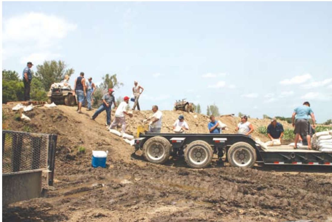
Just one of several- Trailer loads of sandbags that were hauled and placed on the high bank levee in an attempt to save it and the hundreds of acres of crops and homes it served to protect, is shown above. Sandbaggers worked diligently Monday, June 20, but the levee failed that evening.