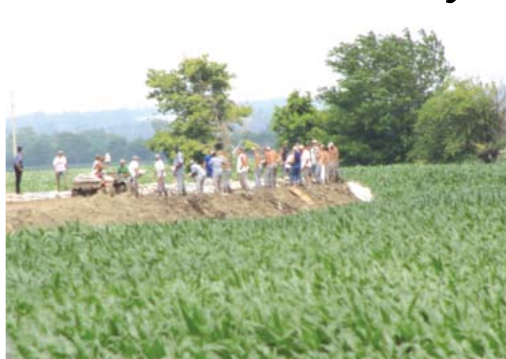
These volunteers- Were trying to protect corn fields near Craig, MO. Area farmers, businessmen, friends and inmates passed and piled sandbags on a high bank levee south of Craig on Monday, June 20. Volunteers worked nearly all day, 'fighting the fight', but ultimately, the levee broke later that evening.

The Mill Creek Levee break has Corning, MO, completely engulfed in water up to six feet deep. Workers making last minute evacu-