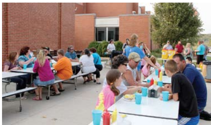
Craig parents, students and staff- Were treated to hot dogs and polish sausages during the Open House event at the Craig R-3 School on Thursday, August 16. Classes began for students on Monday, August 20. The open house was a great way to get acquainted with both the new and old faculty members. The 'picnic on the porch' was provided by the school and prepared by school board members.

BOARD OF DIRECTORS ATCHISON/HOLT AMBULANCE DISTRICT