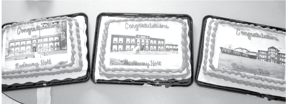
Anniversary cakes in honor of the 50th year of the Nodaway-Holt school consolidation in Graham, Mo. - Were made for the "Meet the Trojans" night on Tuesday, August 19, in Graham. Hot dogs, baked beans, chips, the cakes with Nodaway-Holt school buildings depicted above and cupcakes were served to the crowd in attendance at the annual event.