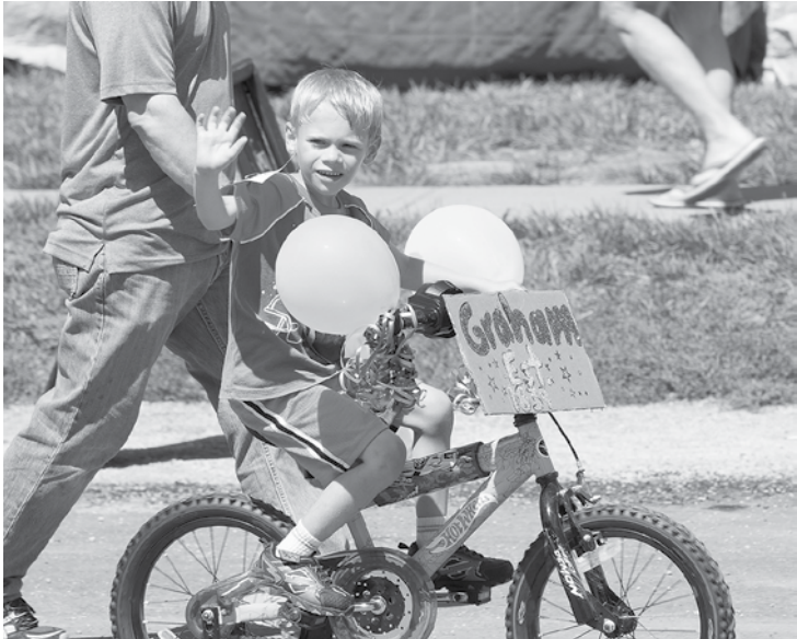
The Children's Parade - Was held before the main parade in Graham, Mo., on Saturday, August 23. Bicycles and other children's vehicles were decorated in honor of Graham's 175th birthday. Riders, like the young man pictured above, had fun waving to the parade crowd lining the streets.