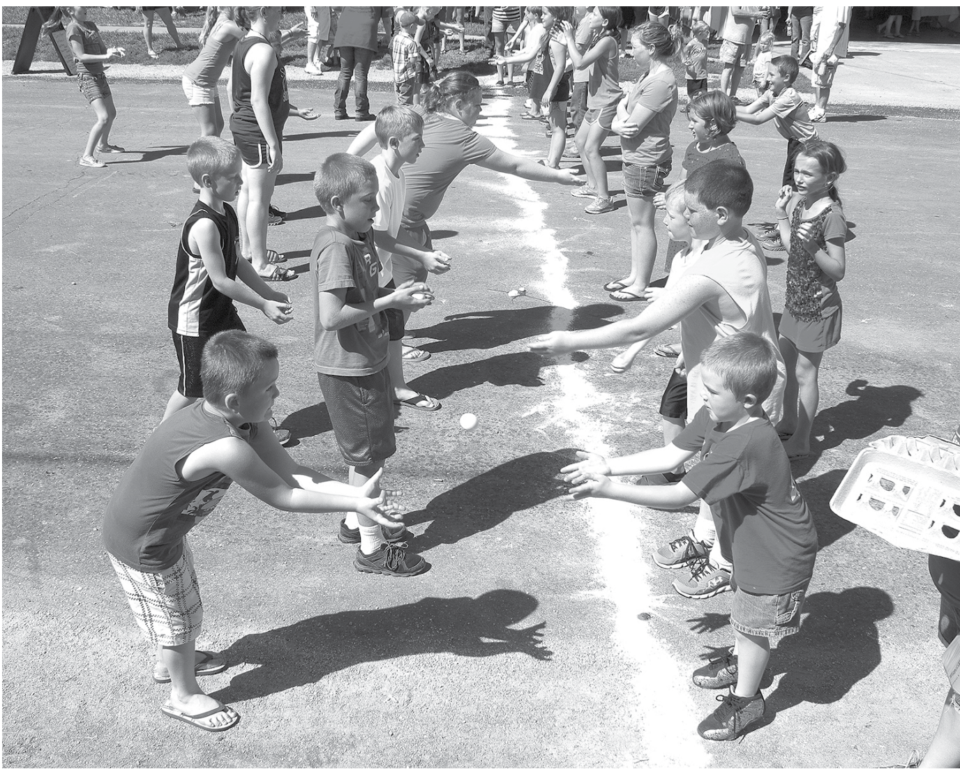
The annual Egg Toss , held in conjunction with the Graham, Mo., Street Fair - Took place on Saturday afternoon, August 23, at 3:30 p.m. on the street in front of the Smokehouse in Graham. Competitors were divided into age groups with first, second and third place prizes awarded in each group. Participants in the 10 years and under division shown in front, above, carefully toss their egg (which is not hard-boiled). Below is a team trying to win in the annual Bathtub Race held in conjunction with the Graham Street Fair. The racing tubs always display a variety of streamlined designs and artwork/decorations.