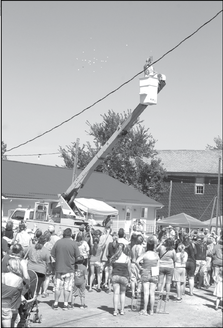
The ping pong ball drop - Was held in front of the Smokehouse in Graham, Mo., on Saturday afternoon, August 23, in conjunction with the annual Graham Street Fair. Ball retrievers claimed prizes during the celebration.