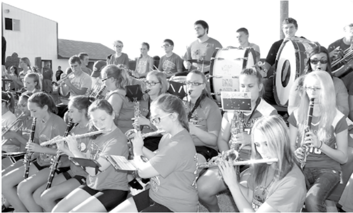
The Nodaway-Holt R-7 band - Plays for the crowd at "Meet the Trojans" on Tuesday evening, Aug. 19, in Graham, Mo.