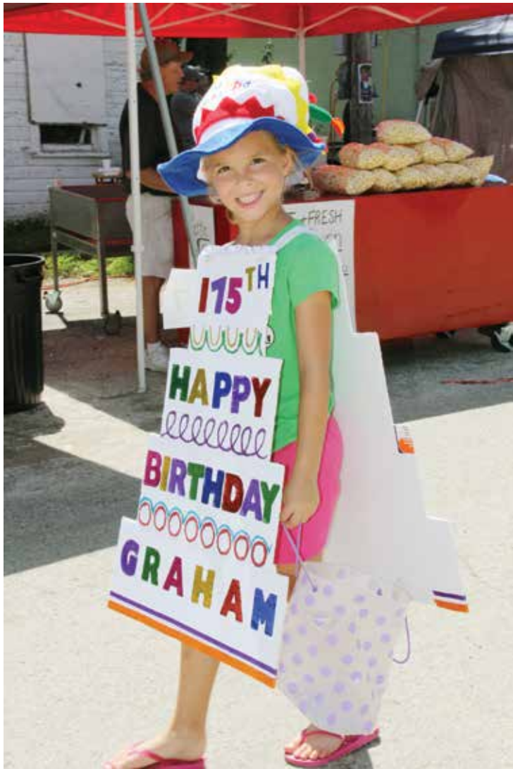
This year's Graham, Mo., Street Fair - Celebrated the city of Graham's 175th birthday. Many parade entries on Saturday, August 23, honored this special quarteptcentennial event by depicting it in some way as the young lady shown above. The annual street fair was held Thursday through Saturday, August 21 through 23.