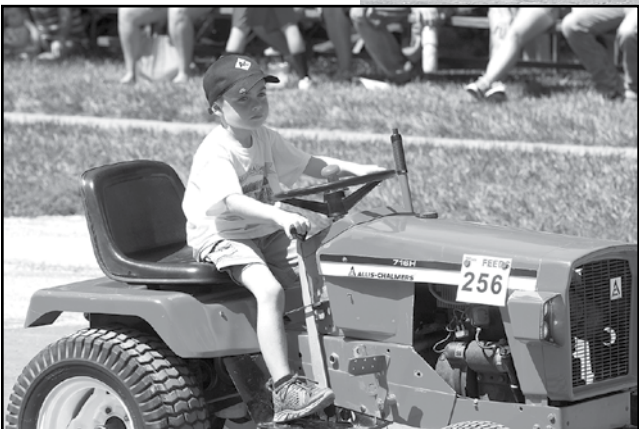
This youngster carefully drives a lawn mower down the street - During the Children's Parade at the Graham, Mo., Street Fair on Saturday, August 23. Entrants in the Children's Parade could not be older than 14.