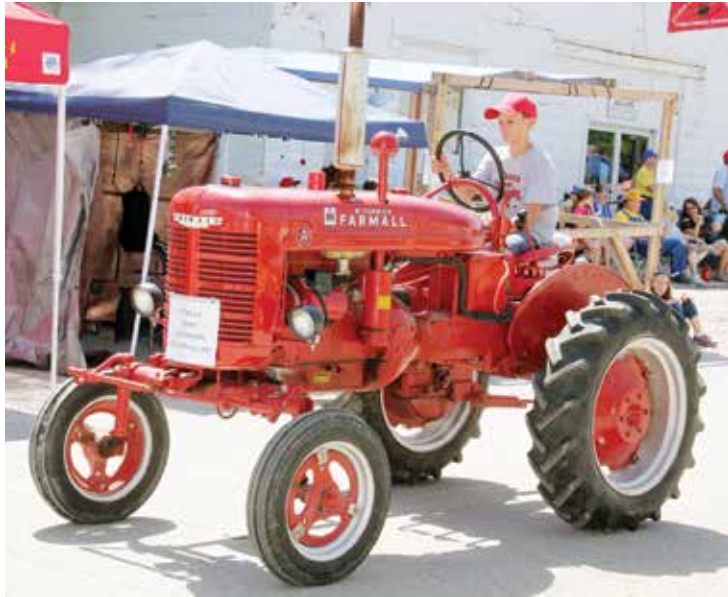
This antique tractor was driven by a young man - In Graham's Street Fair Parade on Saturday, August 23. The parade featured a specific category for antique farm machinery and tractors.