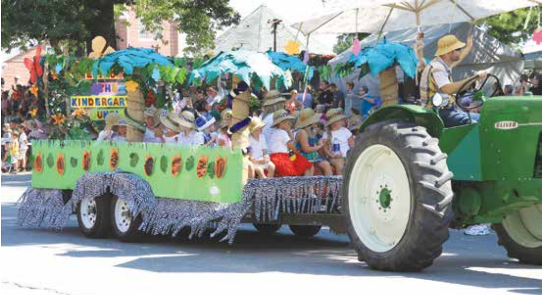
South Holt R-1 kindergarten students - Ride in a “Welcome to the Jungle”-themed float at the Holt County Autumn Festival in Oregon, Mo., on Saturday, Sept. 7, 2013, in this archival photo.