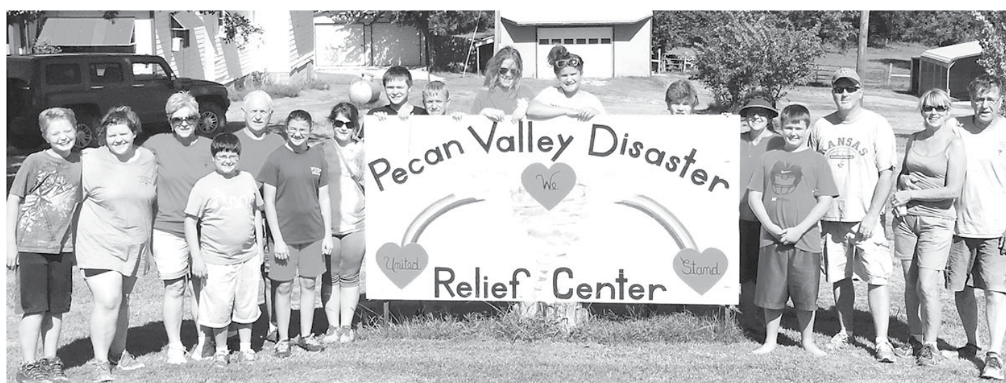
On A Mission 2015 - Traveled to Oklahoma to continue with the rebuilding from tornados that have hit over the last two years. Eleven youth and six adults hammered nails, mowed and raked yards and worshipped with the local people.

We (USA) were referred to as the mixing pot of different races, religion, political beliefs, etc., of the many legal immigrants from many different countries, but then they came to America to be one of us and became a citizen, conforming to our ways, instead of trying to change us to their beliefs and ways, with their hands out expecting to be cared for, like the ones crossing borders. That's the big problem now. After writing this, I feel like going out and trying to buy a Confederate flag. Just kidding?