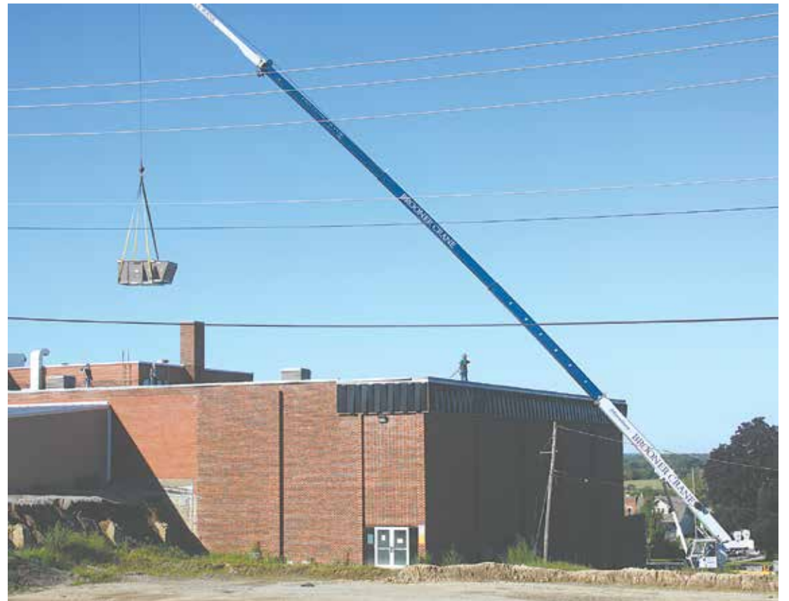
Employees from Brooner Construction and Crane - Guide one of the large air conditioning units onto the roof of the gymnasium at Mound City R-2. The patrons of the school district passed a bond last year that included the installation of new heating and cooling units throughout the school.