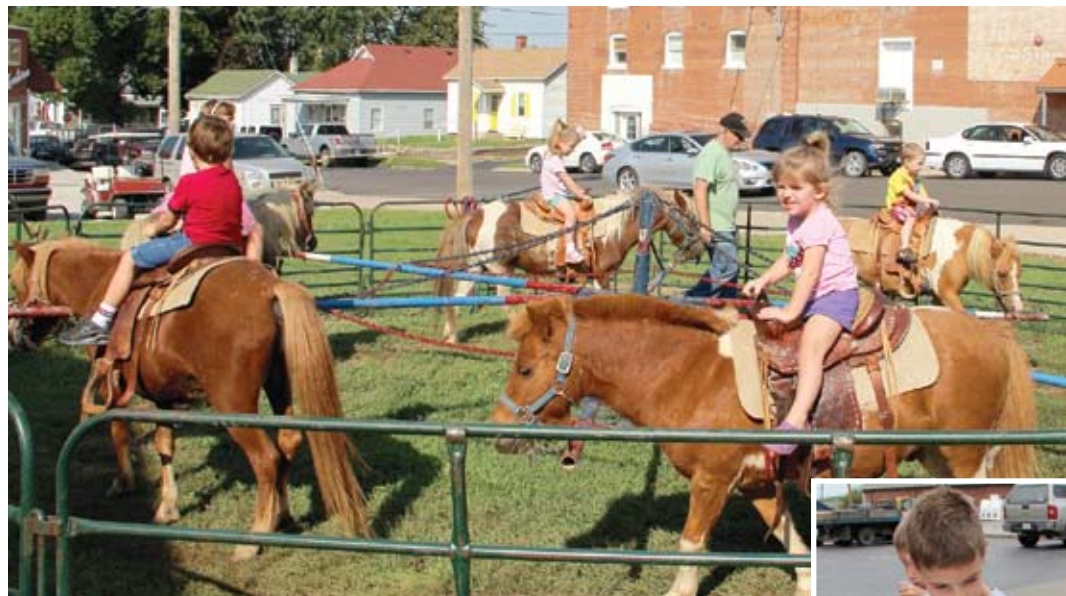
The ponies labored away under many eager riders- During Market Square Day activities in Mound City, MO, on Labor Day, Monday, September 3.