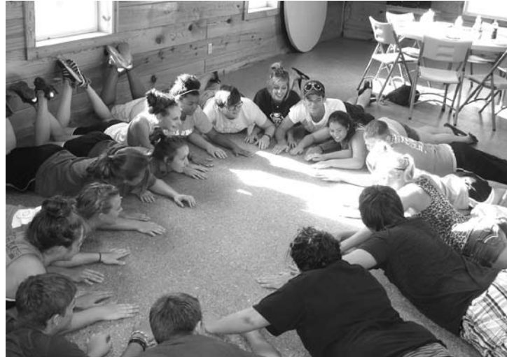
Nodaway-Holt FCCLA Chapter Officers- From around Region 1 participated in a team-building exercise at the Region 1 Officers' Retreat and Summer Planning meeting at Mozingo Lake in Maryville, MO, at Tuesday, July 31.