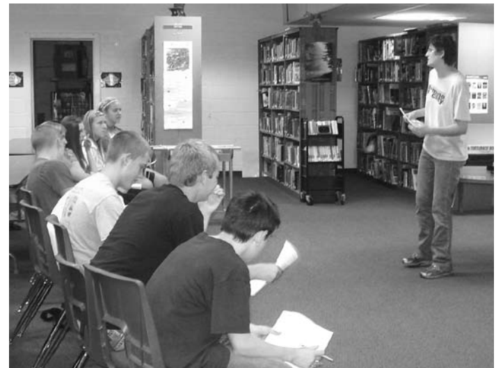
A Nodaway County Animal Shelter employee- Presented information to the Nodaway-Holt FCCLA members on Tuesday, August 28, on how to handle shelter animals and rules of working at a shelter.