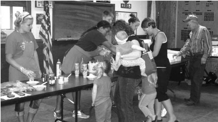
Nodaway-Holt FCCLA Chapter Officers- Served ice cream sundaes to community members and their families during the Graham, MO, Street Fair on Saturday, August 25.

nity members. A garage sale began at 8 a.m. and members wrapped the day up with an ice cream social at 3 p.m. The FCCLA Chapter members would like to recognize everyone that came out to support them. It was a great weekend at the fair!